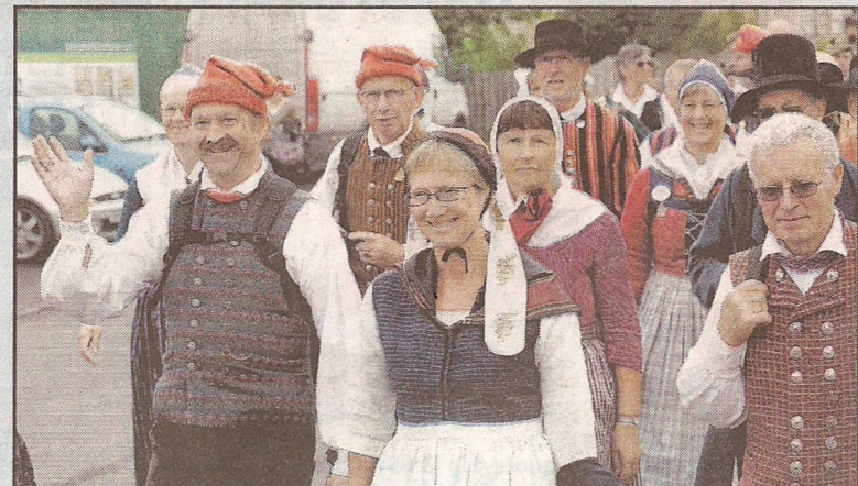
DANISH STYLE: '12 Tur' Danish folk group dancers take their part in the parade before their brilliant performance.