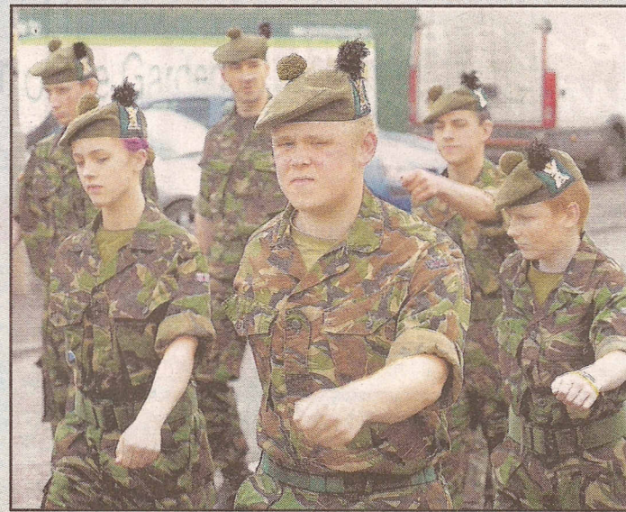
ON THE MARCH: Larkhall and Hamilton army cadets marching down the village. They provided brilliant fun and exercise with their climbing frame, abseiling and assault course.