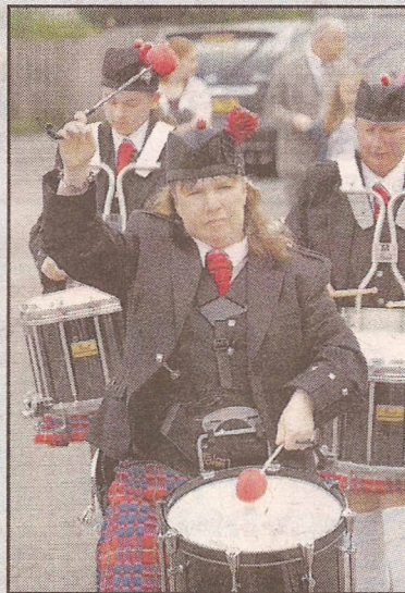
DRUMMING UP SUPPORT: Stonehouse Pipe Band drummers keep the beat and they march through the village and parade.