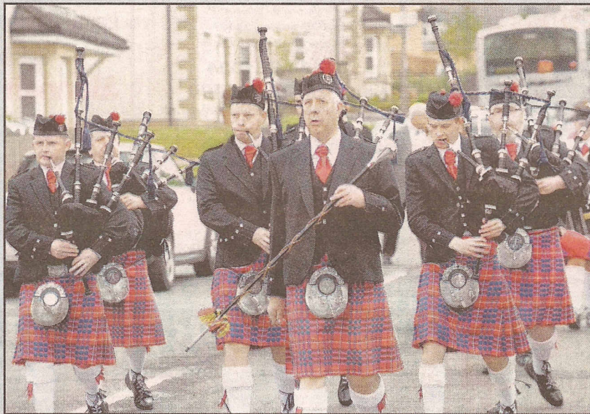
TOP ENTERTAINMENT: Stonehouse Pipe Band piped and also played and danced the Hokey Cokey to the delight of the crowds.